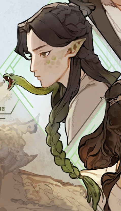
DEMON GENERAL ZHUZH-LANG