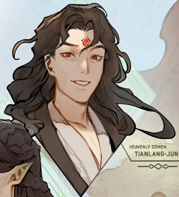
HEAVENLY DEMON TIANLANG-JUN

Luo Binghe has finally made his desire for his old master clear. For all that Shen Qingqiu longs to return to their peaceful days together on Qing Jing Peak, he knows it's impossible now that Luo Binghe has darkened into a true demon lord. But as Shen Qingqiu begins to uncover more of Proud Immortal Demon Way 's hidden plot, including his host body's own backstory, he realizes he must learn to see Luo Binghe for who he truly is if either of them are to survive.